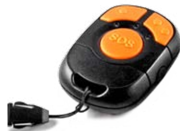
Keyfob extension IEEE 802.15.4 option required